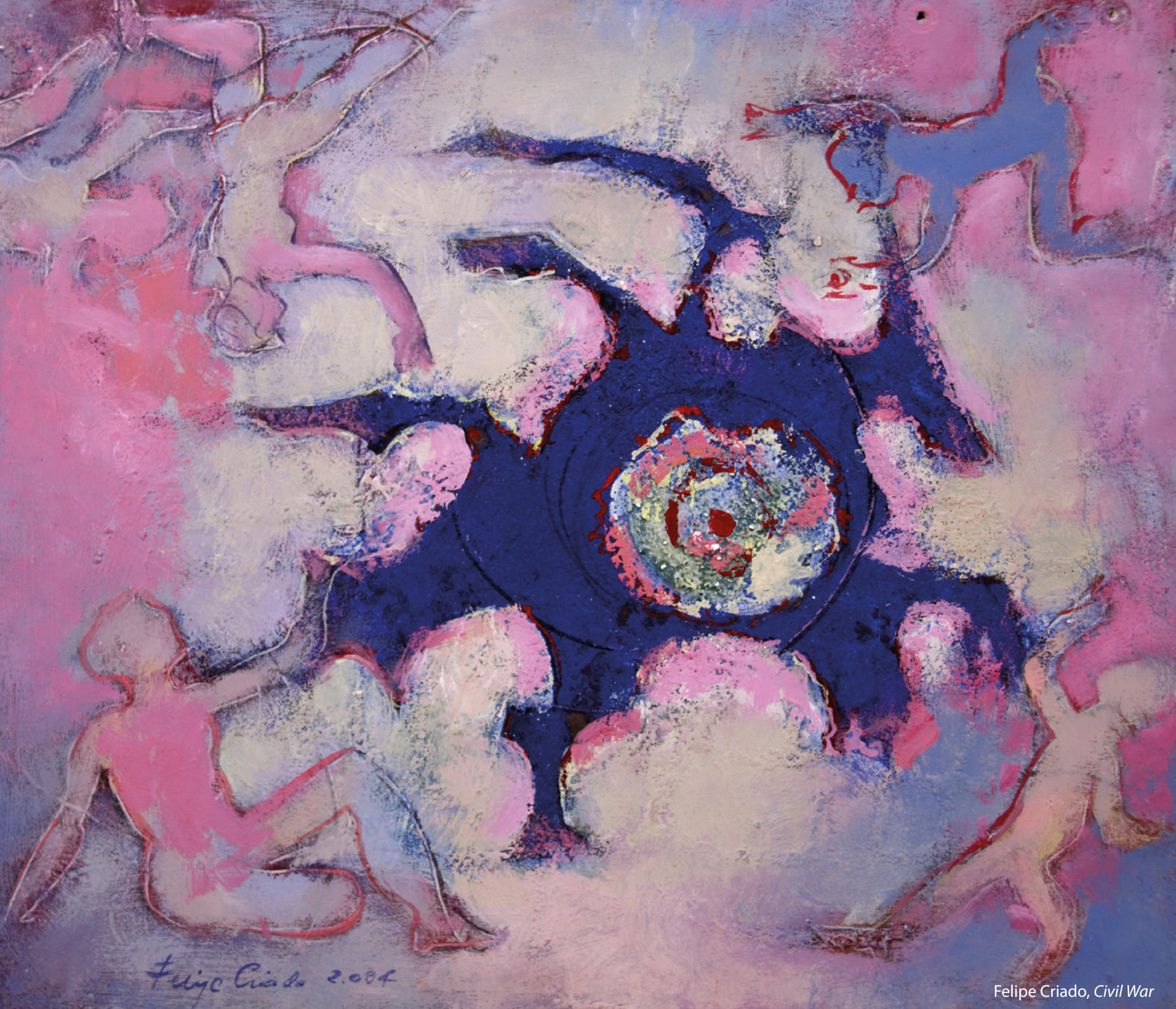
Felipe Criado, Civil War